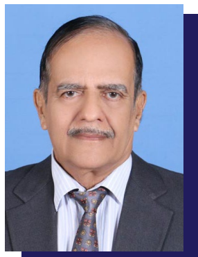
Ramadasan Kuttan Amala Cancer Research Centre, India