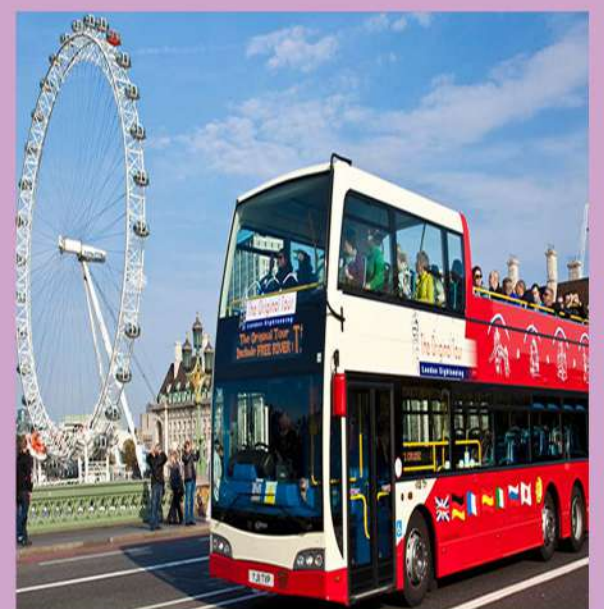
Hop on hop off bus tour