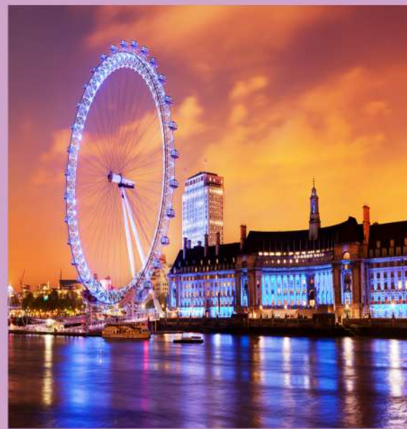
Coca-Cola London Eye