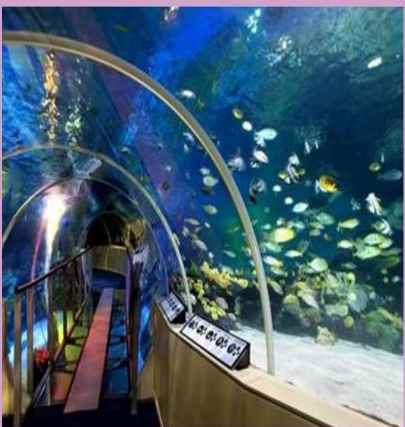
SEA LIFE London