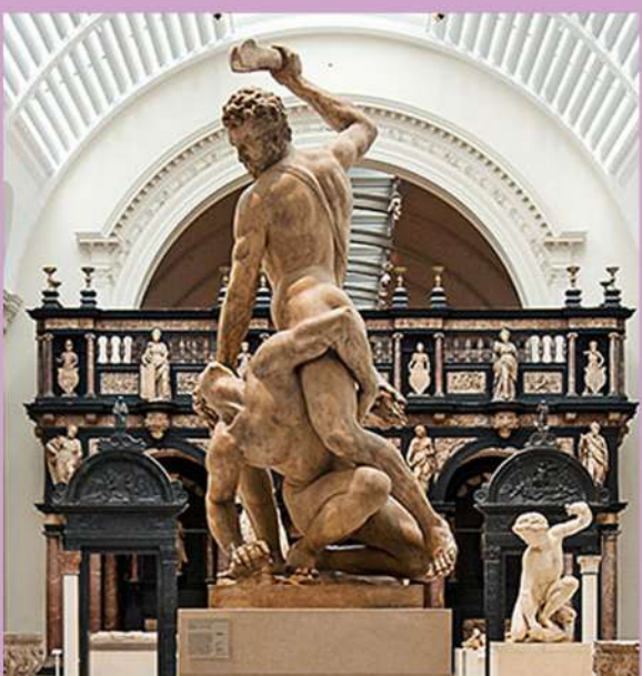
Victoria and Albert Museum