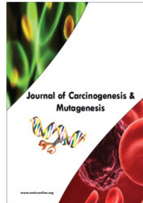
Journal of Carcinogenesis & Mutagenesis