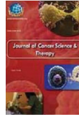
Cancer Science & Therapy