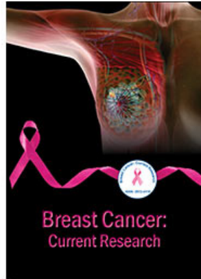
Breast Cancer: Current Research