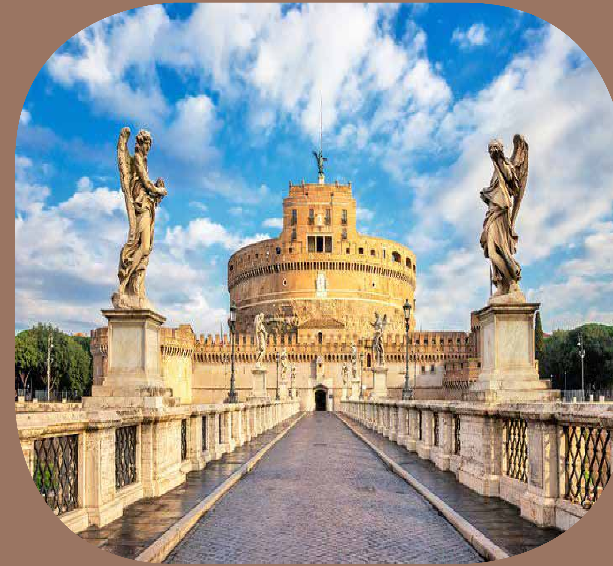
Castel Sant'Angelo National Museum