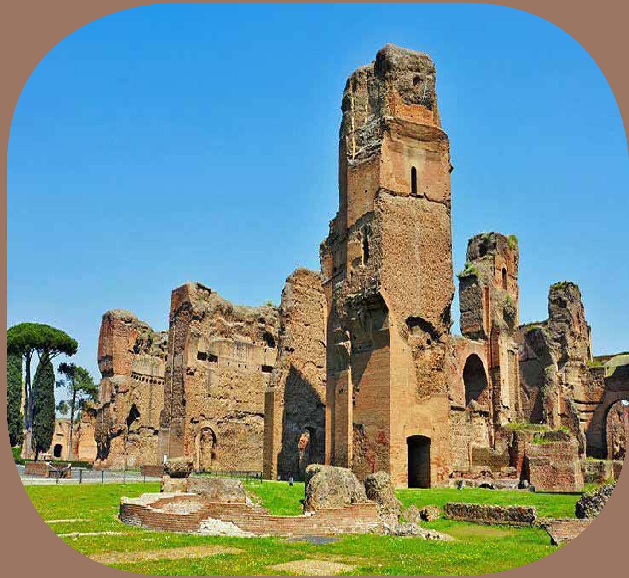
Baths of Caracalla