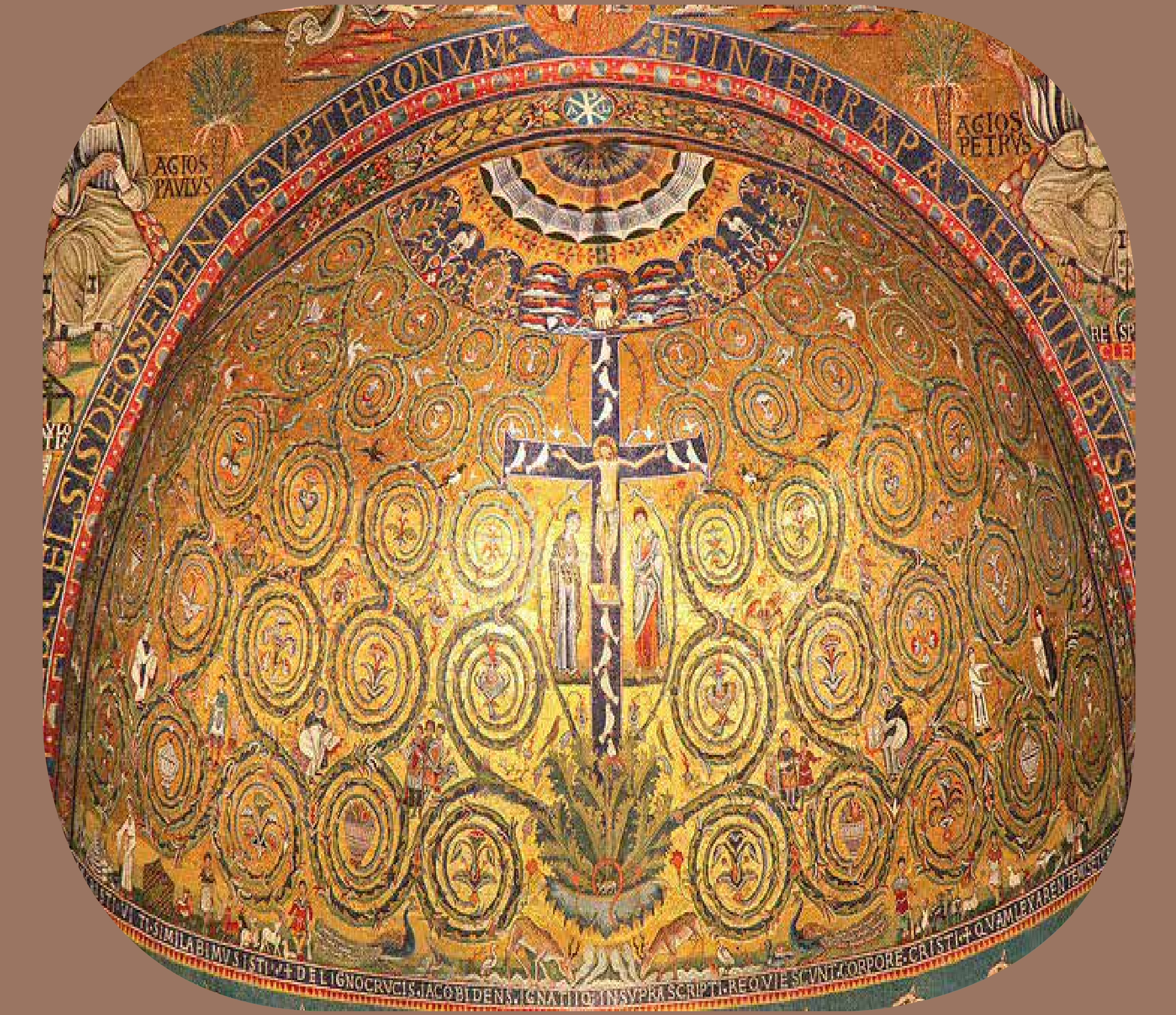
Church of San Clemente