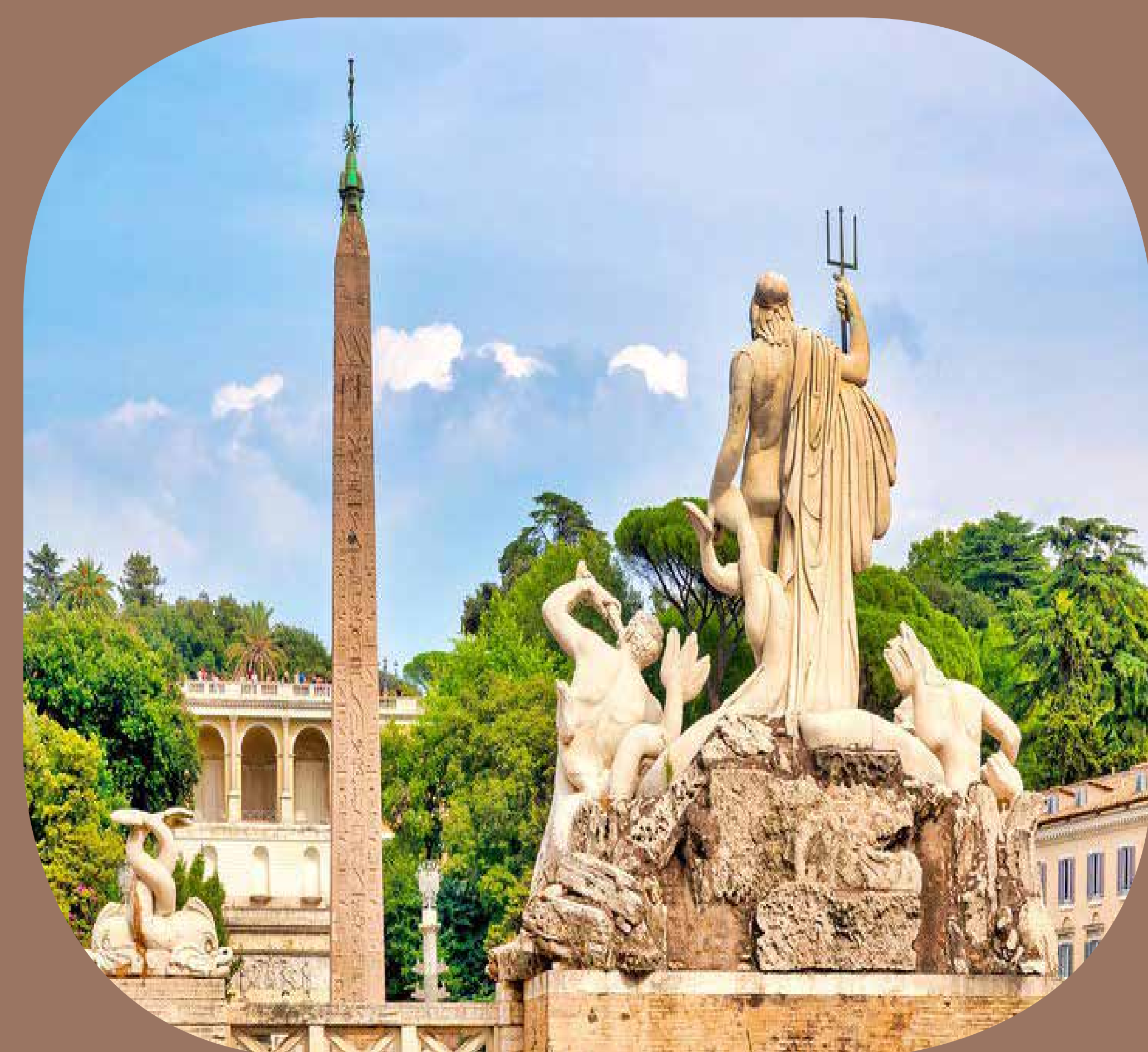
Santa Maria del Popolo