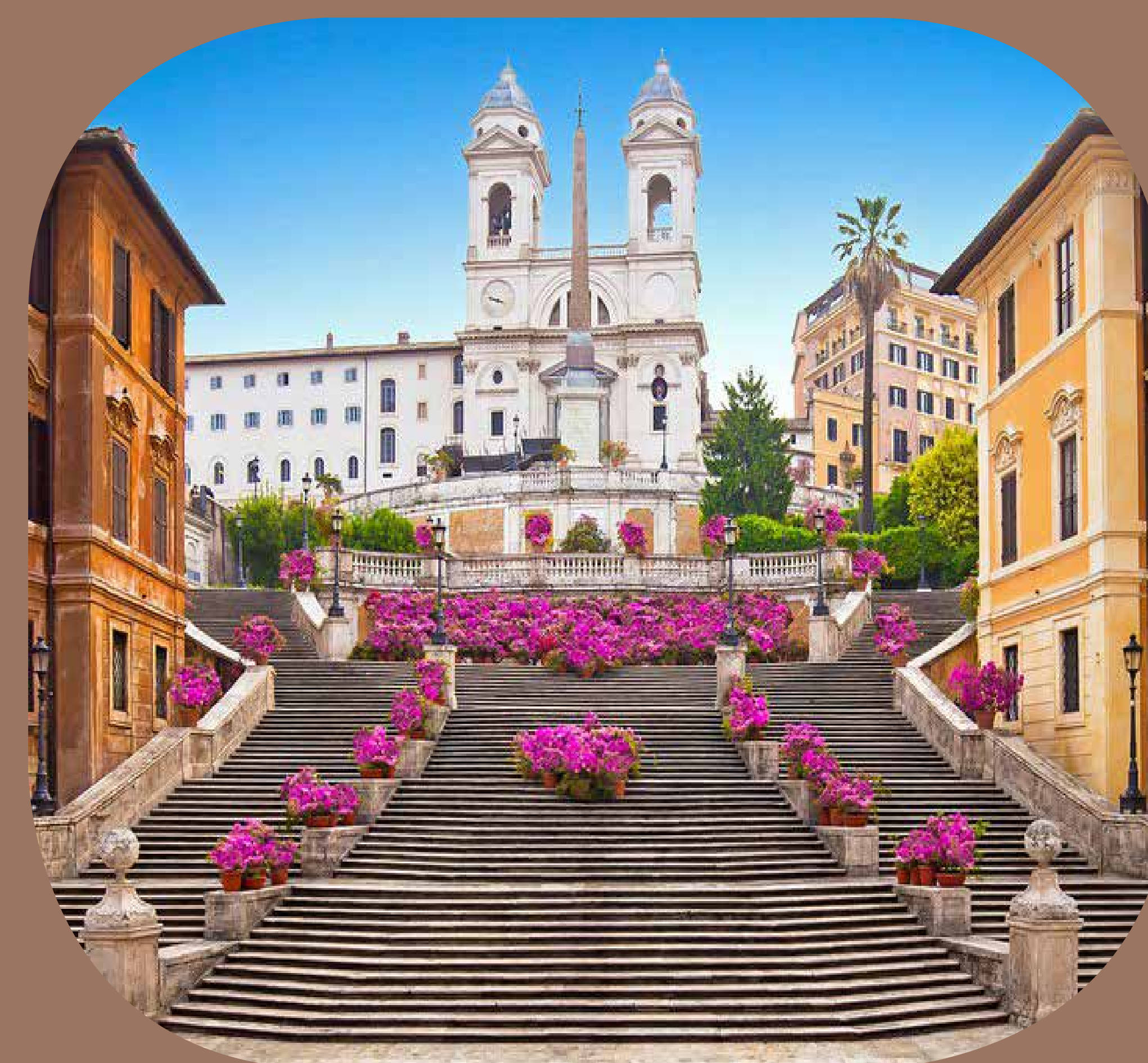
Santa Maria Maggiore