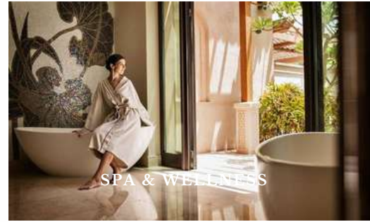
SPA & WELLNESS