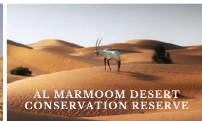
AL MARMOOM DESERT CONSERVATION RESERVE