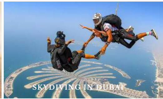
SKYDIVING IN DUBAI