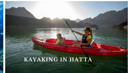
KAYAKING IN HATTA