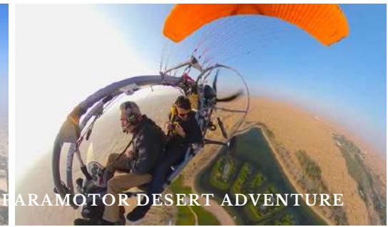
PARAMOTOR DESERT ADVENTURE