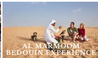
AL MARMOOM BEDOUIN EXPERIENCE