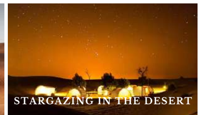
STARGAZING IN THE DESERT