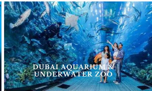
DUBAI AQUARIUM & UNDERWATER ZOO