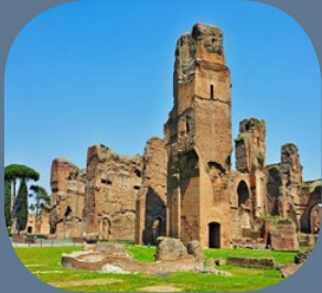
Baths of Caracalla