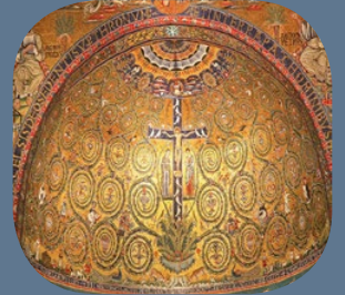
Church of San Clemente