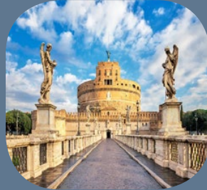
Castel Sant'Angelo National Museum