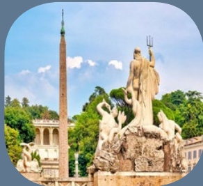
Santa Maria del Popolo