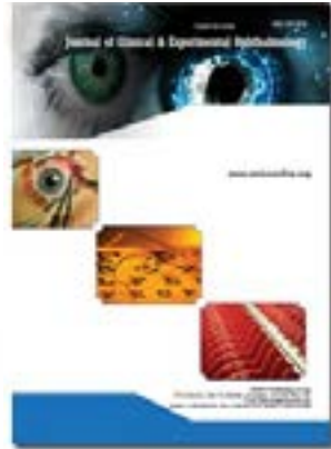
Journal of Clinical Experimental Ophthalmology