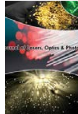
Journal of Lasers Optics Photonics