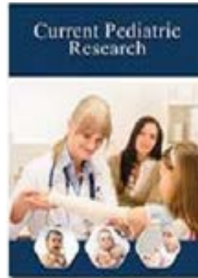
Pediatrics & Health Research