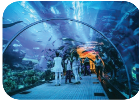
Dubai Aquarium & Underwater Zoo