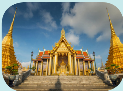
Wat Phra Kaew