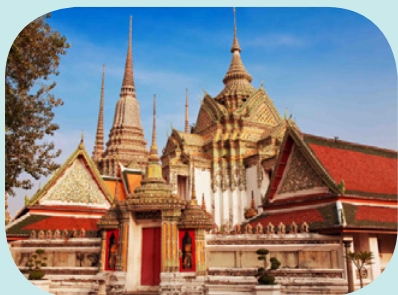
Wat Phra Chetupon