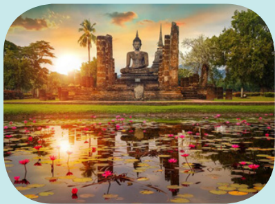
Ayutthaya Ancient Temples