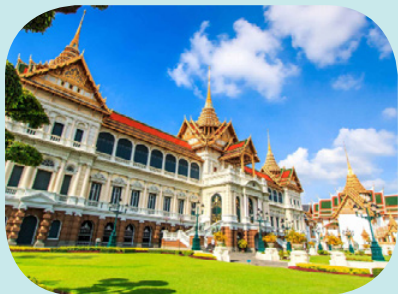
Grand Palace Bangkok