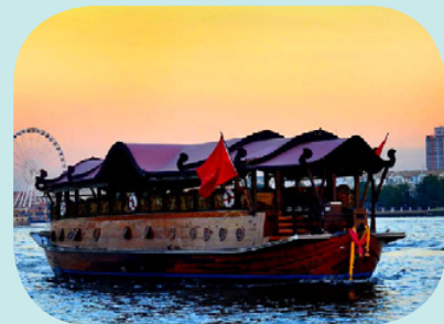
Manohra Luxurious Dinner Cruise