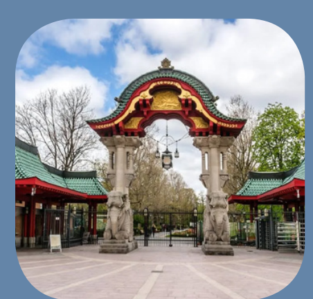
Berlin Zoological Garden